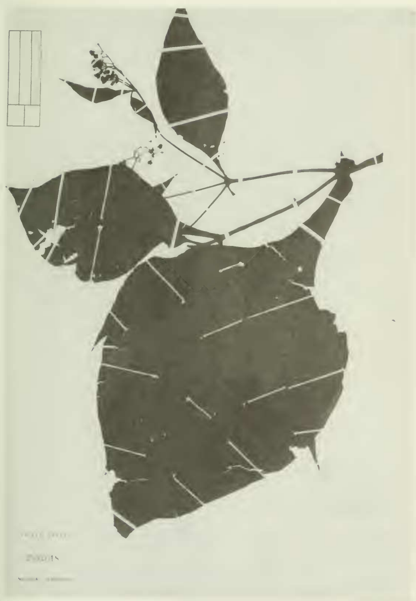
Ichthyothere garcia-barrigae H. Robinson, Holotype, United States National Herbarium.